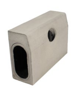
Half Battered 321 500mm