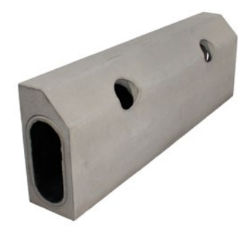
45° Splayed 321 1000mm