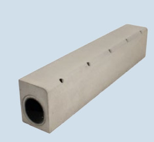
Centre Stone 321 1000mm