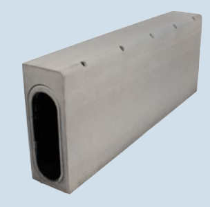
Centre Stone 502 1000mm