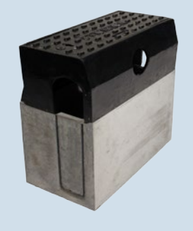
Half Battered Access Cover with Rodding Box for 502 System