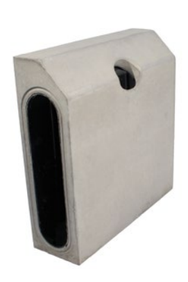
45° Splayed 502 500mm