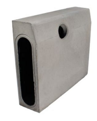
Half Battered 502 500mm