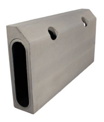
45° Splayed 502 1000mm