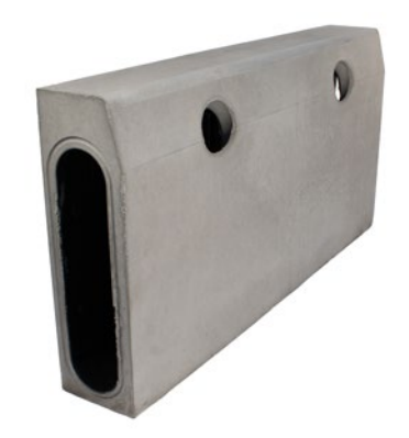
Half Battered 502 1000mm