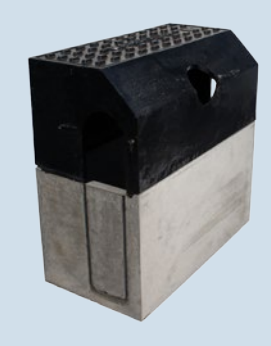
45° Splayed Access Cover with Rodding Box for 502 System