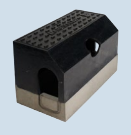
45° Splayed Access Cover with Rodding Box for 321 System