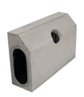
45° Splayed 321 500mm