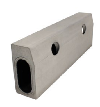
Half Battered 321 1000mm