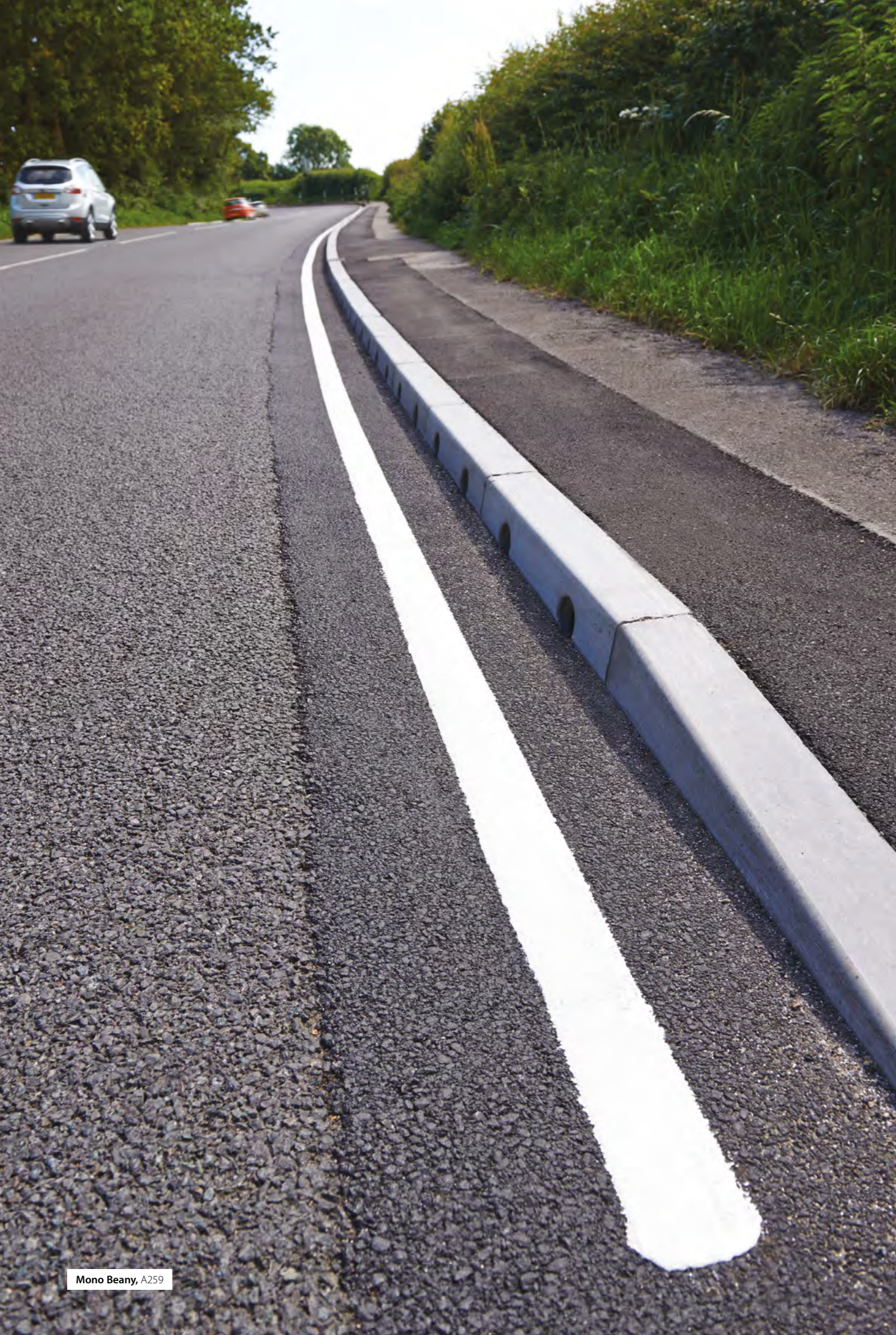
Mono Beany, A259